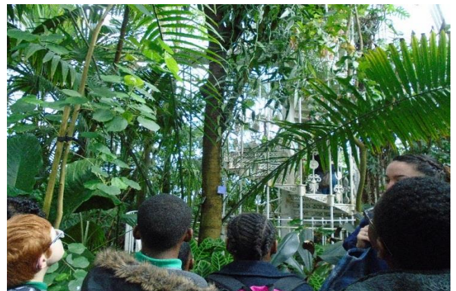
This flower is from a banana plant.

In term 4 we all went off to Kew Gardens and took part in workshops as well as having time to explore the gardens for ourselves. Some of us were brave enough to walk above the trees and we enjoyed the different greenhouses and areas. This trip supported our work on Geography as we have been working on maps and we were able to find out interesting facts about the countries we have studied.