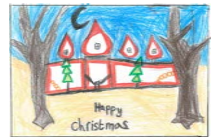
Adebisi, age 9