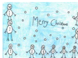
Ramario, age 8