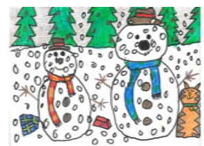
Ben, age 10