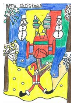
Billy, age 9