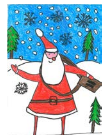
Carlos, age 10